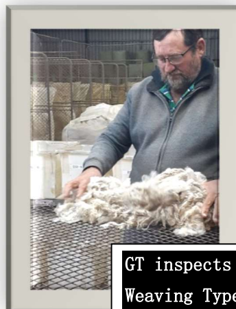
GT inspects and classes Weaving Type fibre in the AMMO warehouse.