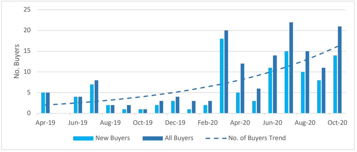
Figure 1. The number of total buyers each month compared with how many of these are new successful buyers.

Driven by demand from the market, goat sales quickly became an established weekly online market since 2019, and in the same year AuctionsPlus offered 17,000 head across a variety of stock categories & breeds. 2020 YTD there has been 52,000 head offered online, a 306% increase. Not only has supply increased, but the demand has also followed & the number of buyers has quadrupled year on year to 101 unique purchasers and averaging 91% clearance in the 2020 YTD.