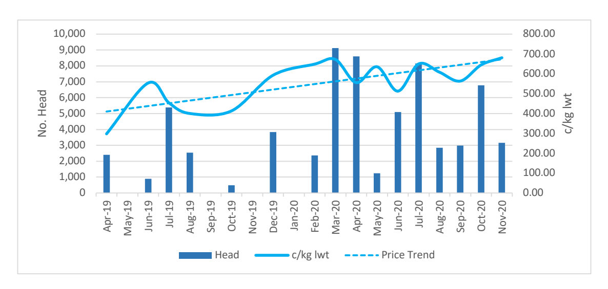
Figure 2. Price trends & throughput of Rangeland & Rangeland Cross goats on AuctionsPlus since 2019 through to November 2020.

Looking at strictly Rangeland & Rangeland Cross animals online, there has been significant growth in number of head offered, particularly in the last 6 months. Not dissimilar to the OTH market, the lwt price of trade goats has been steadily increasing from an average of 452c/kg in 2019 to 617c/kg so far in 2020.