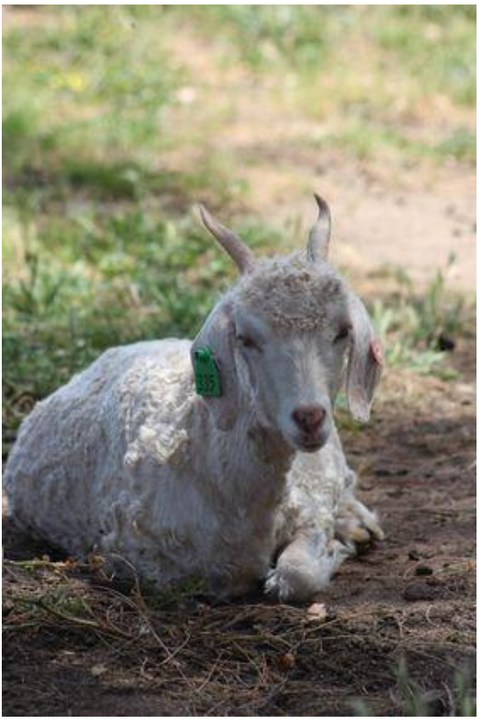
Sapphire 335, who is three quarters Heritage and one quarter Old Australian genetics.