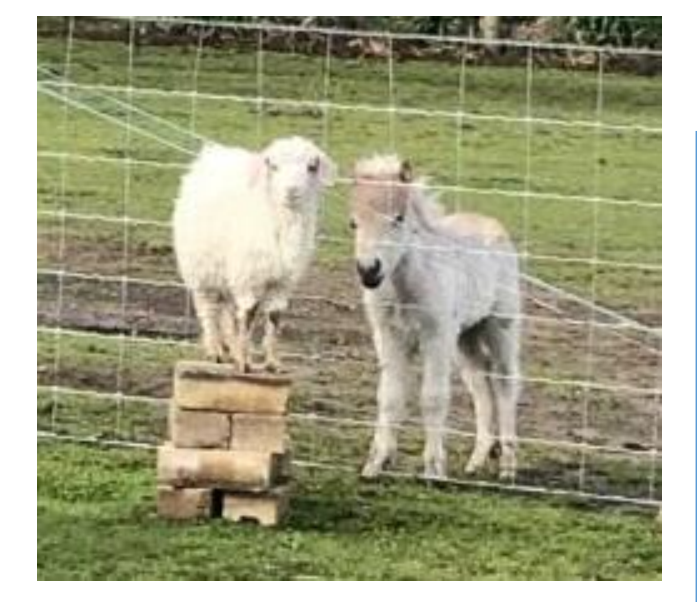
Double celebrations in Tyabb with Widdershins Tilly, on the left and Widdershins Phantom on the right doing some interbreed bonding. They were both born in August.