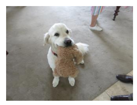
Millie, Hillary's dog before we all arrive

There is still much to be determined before this standard is implemented. It is only when the costs and benefits are better established will mohair producers be in a position to determine if RMS certification will be advantageous in their particular situation or not.