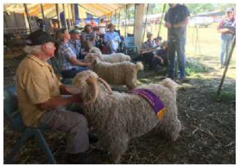
4 October 2018