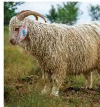
This ram, bred from Rietfontein's stud 325 bloodline, grabbed the attention at the Rietfontein Angoras and guest sellers' 2022 auction.