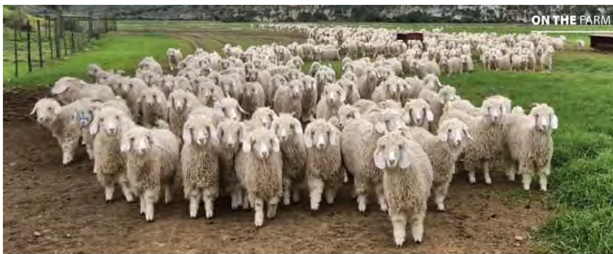
The stud was registered in 2012 and meticulous record-keeping is used to identify the parents of the kids that produce the most promising fibre at the first shearing in February.

development at The House of Fibre. This especially relates to the progress in the stud and commercial herd.