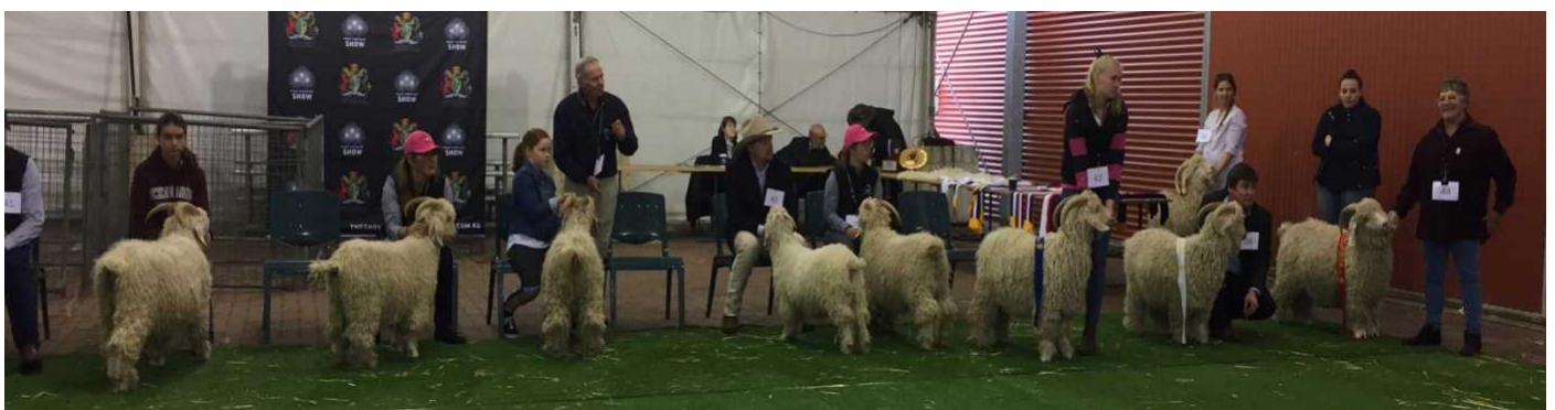
Yearling Buck Class