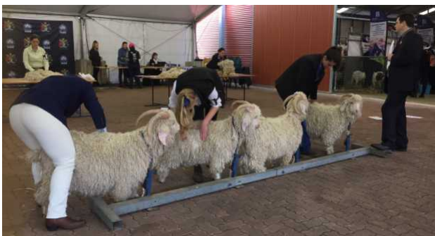
National Young Judges Competitors assessing Angora Goats