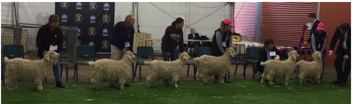
Yearling Doe Class