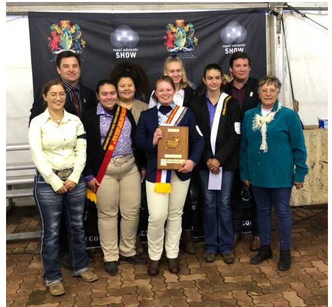
All Finalists, Winners and Judges