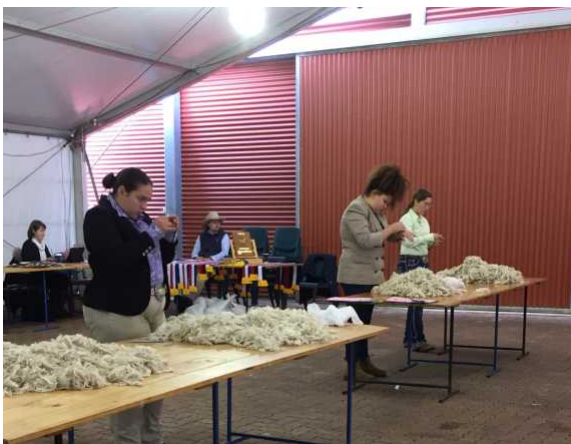
National Young Judges Competitors assessing Mohair Fleeces

Come on Tassie and Western Australia with a bit of effort you too can have contestants!?