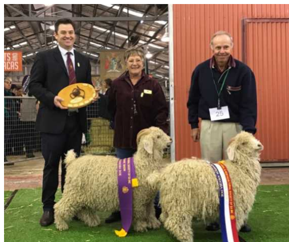
Champion Does Lynndon Grove Angora Stud

State Young Judges Final along with National Young Judges were held Thursday morning at 9am commencing with the National Final to complete the 2018 State Final Challenge from each state.