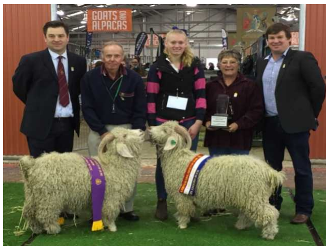
Champion Bucks Lynndon Grove Angora Stud

Stud animals were Judged Wednesday the 4 th commencing at 9 am with the adult Doe classes over 38 mth and older through to the under 14 mth doe classes -all Doe and Buck classes were well represented by 5 studs on the day being Lynndon Grove & Amarula Angora Goat Studs, Ansebury Hill , Cedar Grange and Aanaarden Park .