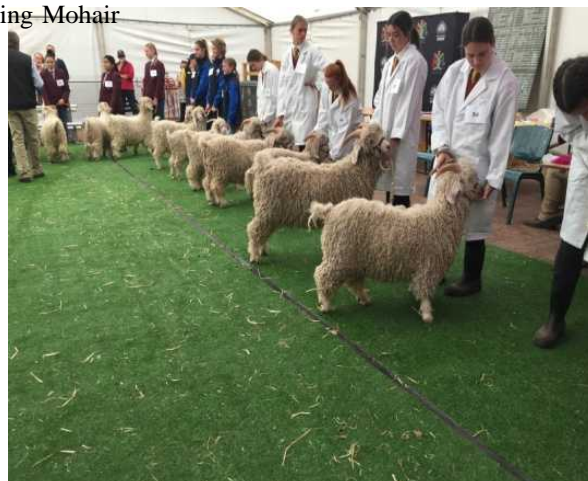
National Young Judges Competitors assessing Mohair Fleeces