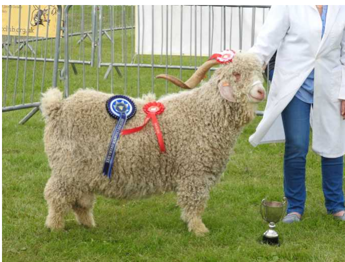
3737 Reserve Champion buck