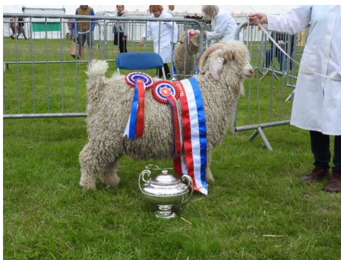
3748 – Champion Buck