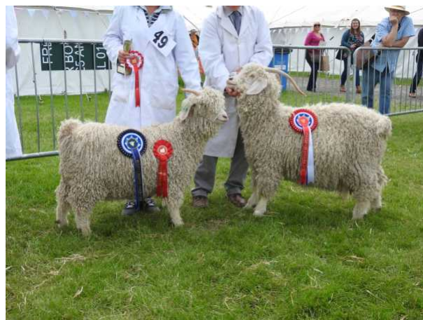
3741 – Champion Does – Reserve on left, Champion on the right.