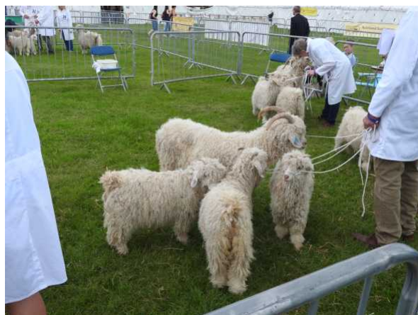
3715 – Mayhem in the showing – Senior Doe class