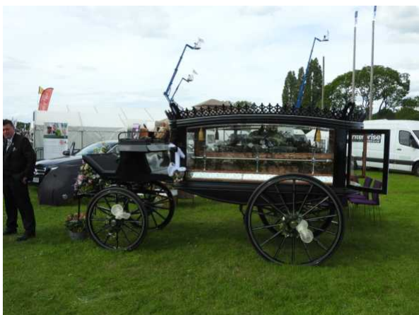
3761 – Something different at a Royal Show – horse drawn hearse on display