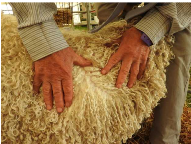
3760 – Open fleece of young doe – Australian genetics