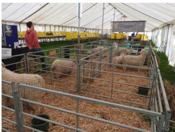
3682 – Animals and Fleece displays in the marquee at Royal Three Counties Show