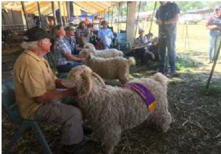
4 October 2018